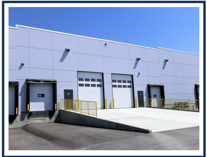
DOCK AND DRIVE-IN LOADING