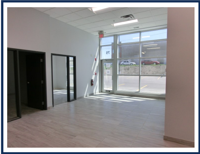
MAIN ENTRANCE AND RECEPTION